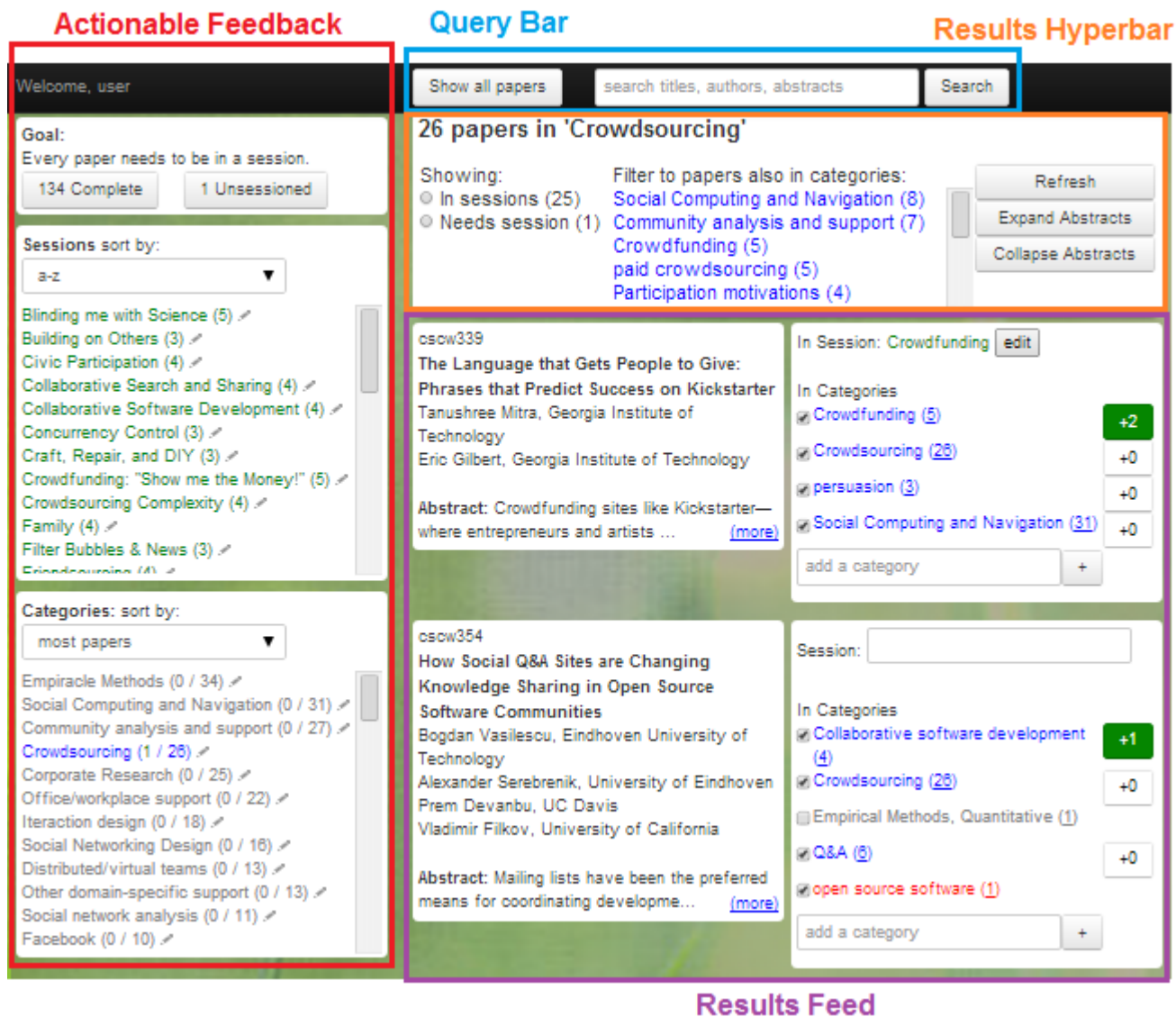
Figure 1. Frenzy interface, highlighting 4 sections: actionable feedback, query bar, results hyperbar, and results feed.

The left panel of Frenzy displays the actionable feedback . In both stages of Frenzy (meta-data elicitation and constraint satisfaction) there are two goals for users to achieve as a group. For example, in the meta-data elicitation stage one of the goals is: “Every category must have at least two papers in it (No singleton categories.)” Instead of instructing users how to achieve this goal, Frenzy provides two types of feedback on progress towards that goal that users can easily take action on (hence the name actionable feedback.) One type of actionable feedback for this goal is the list of categories, with the number of papers in that category in parenthesis. Any categories with only one paper are displayed in red text, indicating a problem. Users can then click on that category to see what paper is in it, and either remove the paper from it (thus deleting the category), or